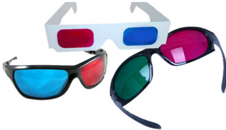
Figure 2. Anaglyph stereoscopic 3D glasses. Left: red-cyan plastic frame glasses; center top: red-cyan paper frame glasses; right: green-purple plastic frame glasses.

After the simulation has started, the student may switch different viewing modes by the ‘View’ drop-down select box in the lower-left. The possible view modes include the inertial ellipsoid, Poinot construction in three variants and the Binet construction. The body may also be hidden by unchecking the checkbox ‘Show rigid body’ to allow better view of the constructions. When viewing the Poinot construction one should note that the polhode (the curve on the constraint ellipsoid) and the herpolhode (the curve on the invariable plane) are drawn by the angular velocity vector, while in the Binet construction the drawing vector is the angular momentum vector, which is restricted to point on the surfaces of the corresponding constraint ellipsoid and sphere.